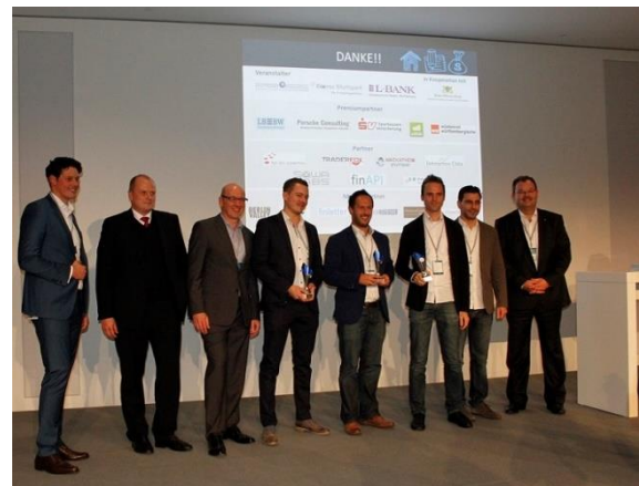
Winner of the hackathon

As a result our team won the first price for the "most innovative idea".